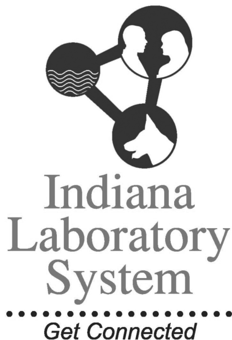
Figure 1. The Indiana Laboratory System logo

and water laboratories. This database is housed on the ISDH Laboratories' SharePoint website. It was used to develop geographical mapping tools to serve as a general reference and to facilitate site visit scheduling. An interactive Web page map provides the name and address of the laboratory, the laboratory director's name, as well as the phone number and e-mail address of a designated contact person. This website is designed for ease of use by member laboratories and can be accessed at http://gis.in.gov/apps/ISDH/ILSLabs .