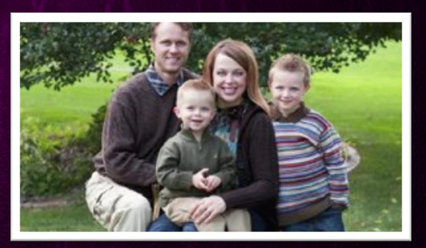
Growing up with Galactosemia

The story of how two moms, with sons born 20 years apart, learned to cope with raising a child born with Phenylketonuria.