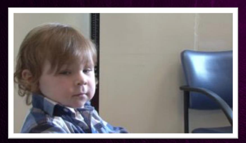
Living with PKU

The story of how two moms, with sons born 20 years apart, learned to cope with raising a child born with Phenylketonuria.